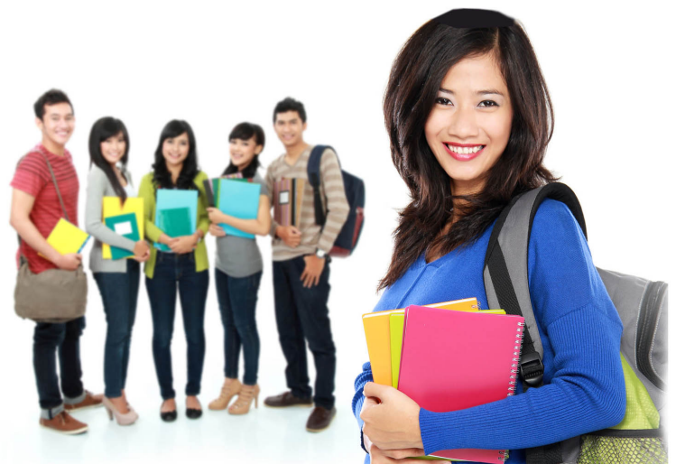
The administrator can view all students' attendance, providing a clearer view of the campus situation and students behavior.